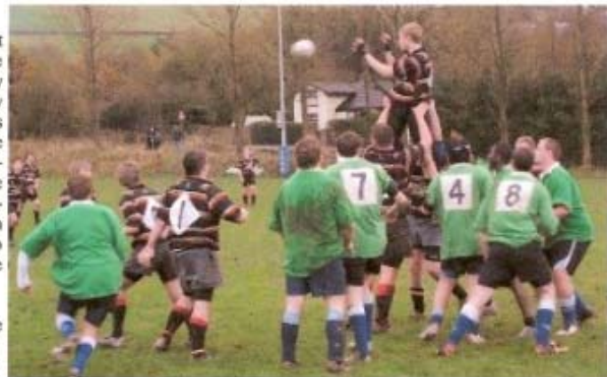
Junior Colts' line out secures clean ball

It has been a pleasure watching them play when they have been focused on the job in hand and as most of them have been playing alongside each other for a while now - the understanding between certain players is growing.